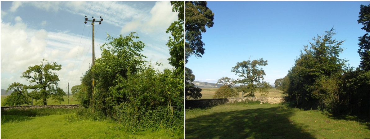
Cover illustration : Beacon Fell, Forest of Bowland AONB