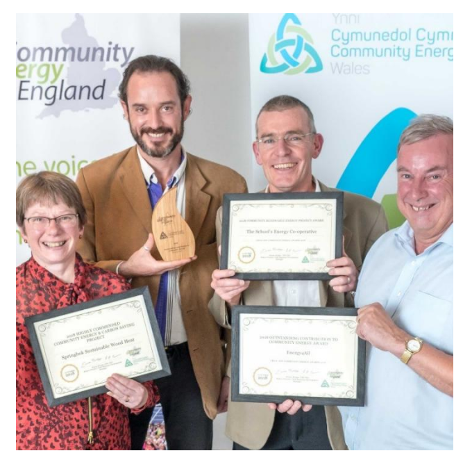
Energy4All: Winner of the 2018 Community Energy award for Outstanding Contribution